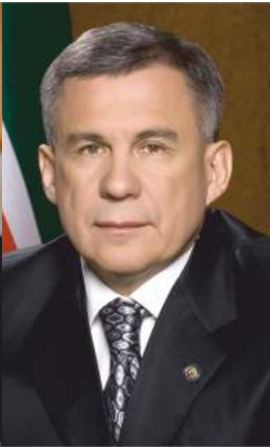
Rustam Minnikhanov President of Tatarstan