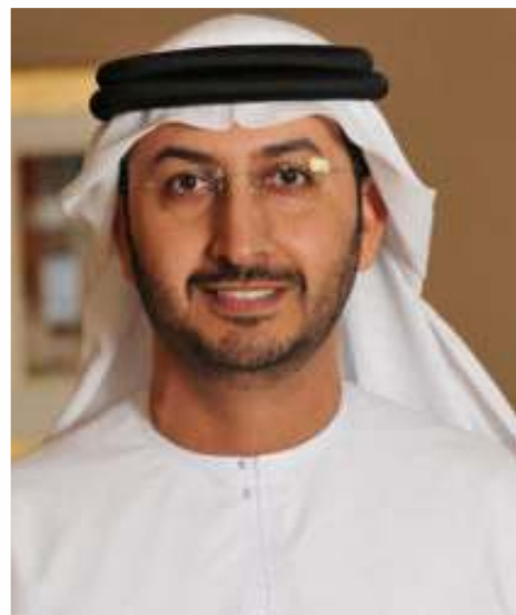
Abdullah Al Saleh Deputy Minister Economy of UAE