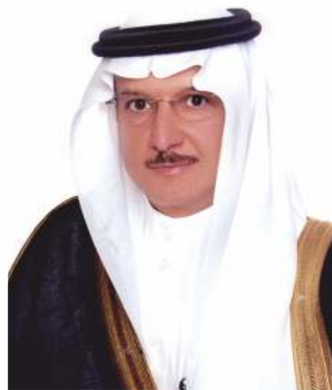
Yusuf Al-Othaimeen Secretary General Organization of Islamic Cooperation