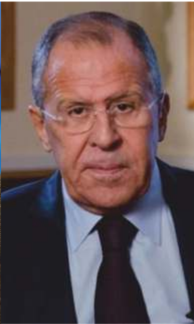
Sergey Lavrov Foreign Minister of Russia