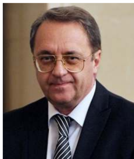
Mikhail Bogdanov Deputy Minister of foreign affairs