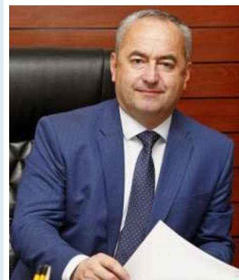
Taimuraz Tuskaev Prime Minister Republic of North Ossetia - Alania