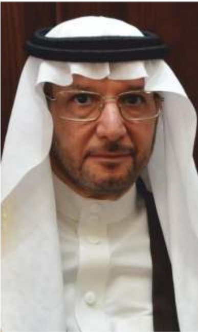
H.E. Dr. Yousef bin Ahmad Al-Othaimeen Secretary General of OIC