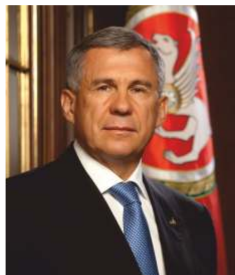
Rustam Minnikhanov President Republic of Tatarstan