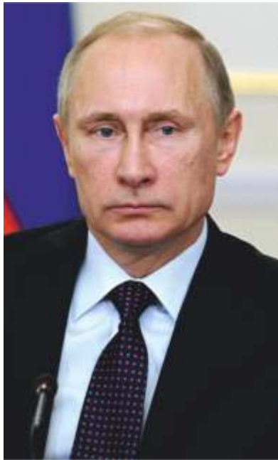
Vladimir Putin President of the Russian Federation

"KazanSummit is an important venue which allows to create business, to interact with prospective investors, to give a new opportunity either for yourself or for your organization."